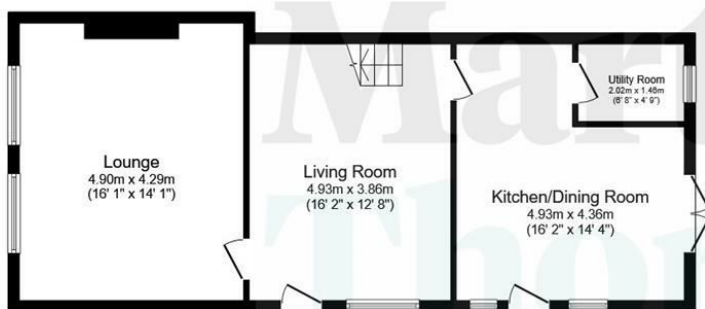
Ground Floor Floor area 64.0 sq.m. (689 sq.ft.)